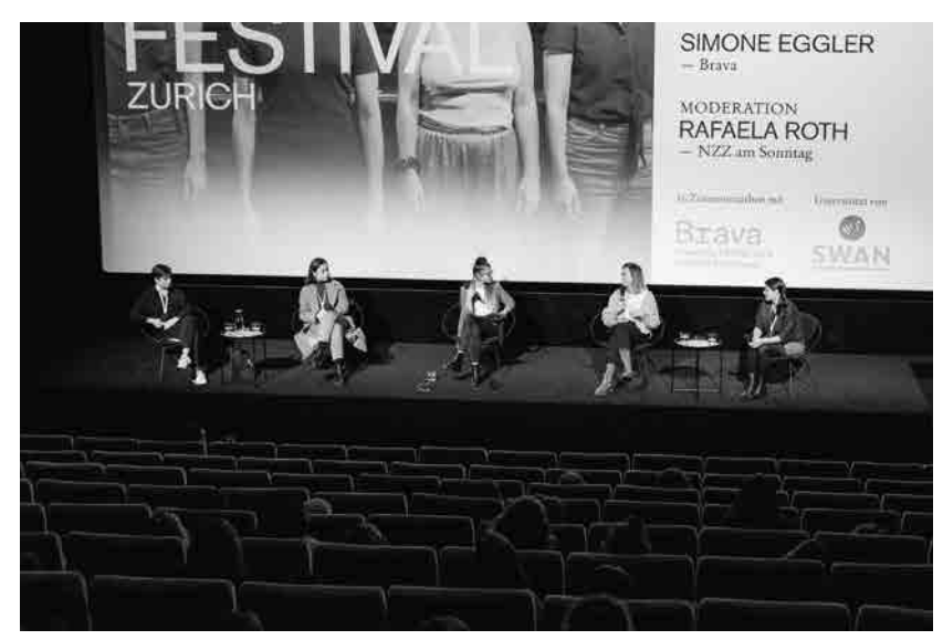
Panellists after the film