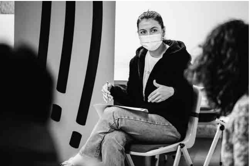
refugee women during an exchange, December 2021